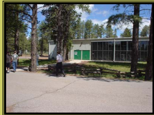
24,400 sq. ft. indoor riding arena

Dual feed city water supply University Highlands / Flagstaff Ranch